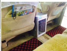
Special Equipment Refrigerator

We will refill Free beverage everyday! Please drink Anytime! <Contents> White wine , Rose wine ,Mineral Water Some Side dishes & Glasses