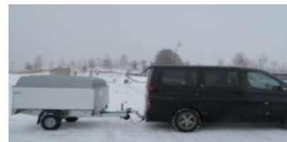
Look of Traction Vehicle & Alphard

We will refill Free beverage everyday! Please drink Anytime! <Contents> White wine , Rose wine ,Mineral Water Some Side dishes & Glasses