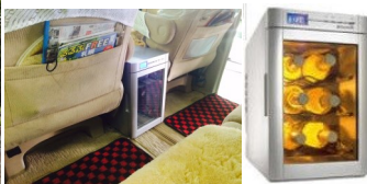
Special Equipment Refrigerator

We will refill Free beverage everyday! Please drink Anytime! <Contents> White wine , Rose wine ,Mineral Water Some Side dishes & Glasses